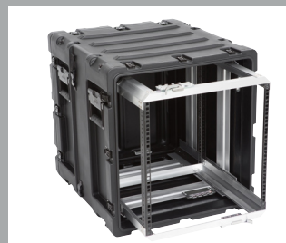
3RR & 3RS