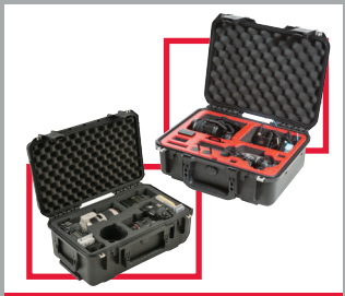
Photo / Video