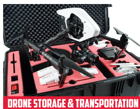
DRONE STORAGE & TRANSPORTATION