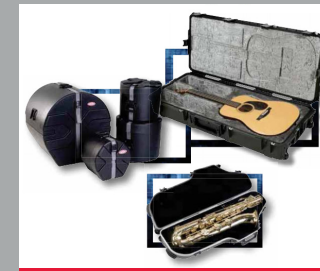
Music Cases & boxes